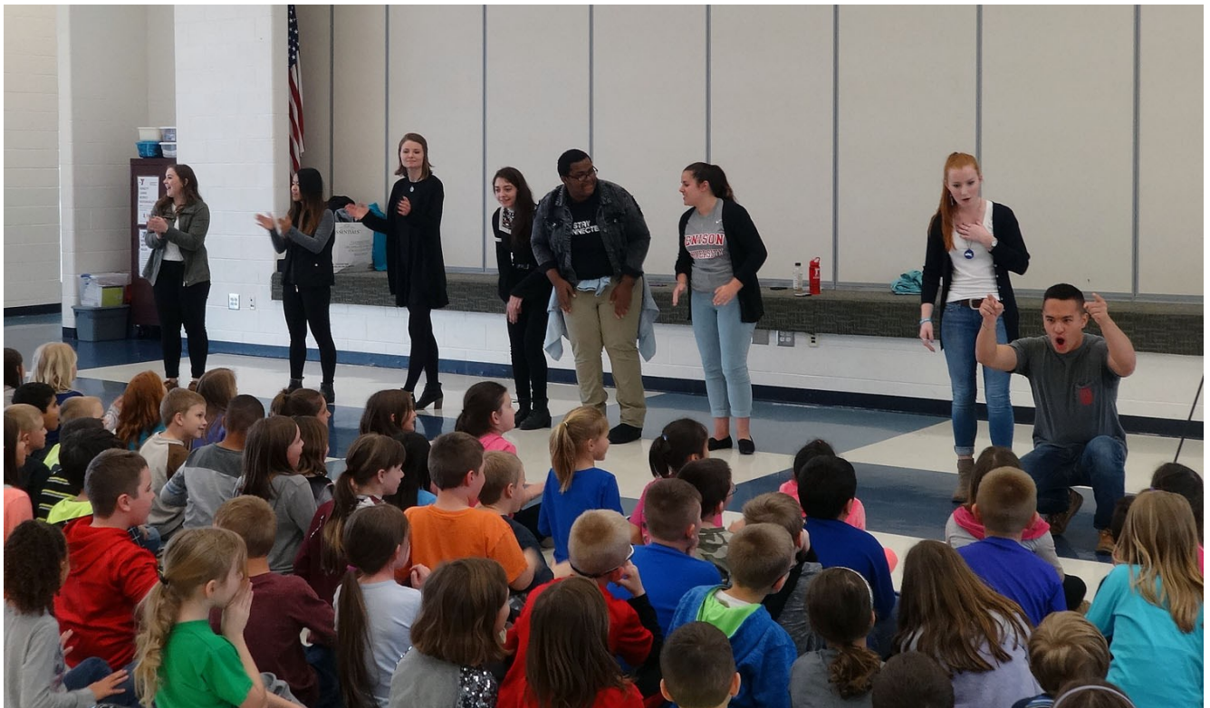
Second graders at both Legend (pictured here) and Hillview, had the wonderful opportunity to learn about A Cappella music and college during two very fun College Comes Into the Classroom events thanks to the Denison student-run singing group, DUwop.