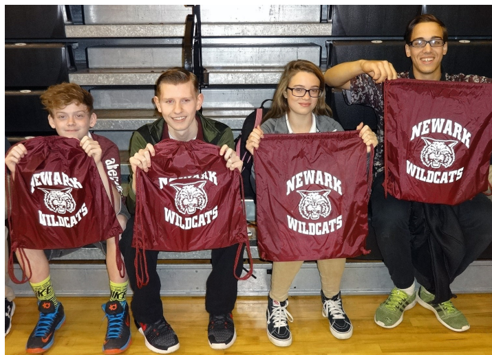
Above, four Wilson Tigers, soon to be Newark Wildcats, pose with the cinch bags they were given after completing Reality Store 2016

brings this on-line tool to life in each middle school. This year, Reality Store will take place on May 15, 19 and 24. These all-day events are made possible by the generous assistance of nearly 100 volunteers from State Farm and Park National Bank (Wilson), Denison (Heritage) and COTC/OSUN (Liberty). Those students assigned to play the role of a high school dropout find out very quickly that their monthly earnings do not go very far and that education pays off! 🐾